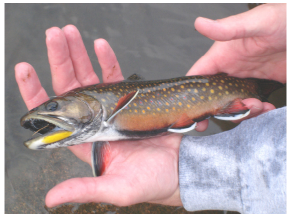
A nice native New England brook trout

Editor's Note: This is a great example of TU resources at work. Learn more by visiting www.TU.org