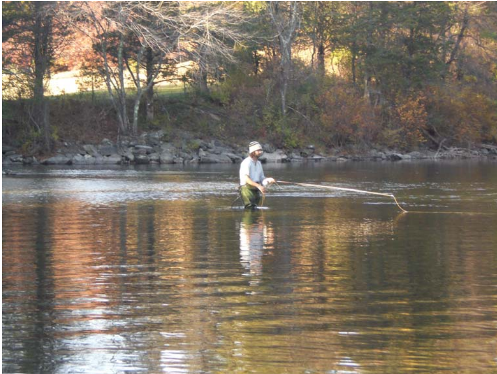
Afternoon temperatures that reached the mid 60's on a recent afternoon allowed this fisherman to get by in shirtsleeves. There aren't many days like this left.